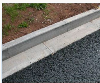
Kerbing & Channeling

Pipes and culverts suitable for the conveyance of stormwater, with ability to withstand the load stress road infrastructure must handle.