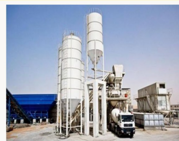
Ready Mix Concrete

Manufacturing of quality kerbing and channeling in the factory and on site.