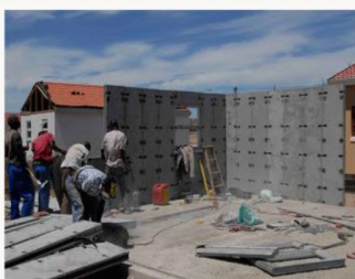
ABT Housing Units

Concretex SA palisade fencing provides increased security and high visibility