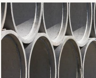
Stormwater Pipes & Culverts

Currently, ConcretexSA produces and offers a range of concrete products that serve markets not only in the Cape but throughout South Africa and the SADC community.