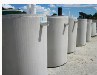
Grease & Oil

Alternative Building System is a modular building technology using custom lightweight concrete panels