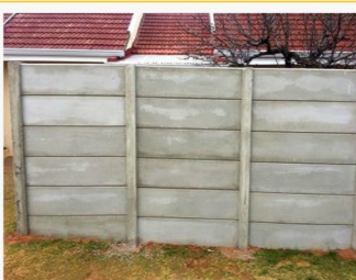
Plain Vibracrete Walling

We have ready mix trucks with the ability to setup mobile batching plant anywhere in the country.