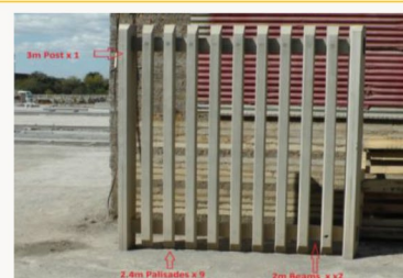
Concrete Palisade Fencing

Block, brick and paver making plant that can manufacture up to 10,000 blocks per day.