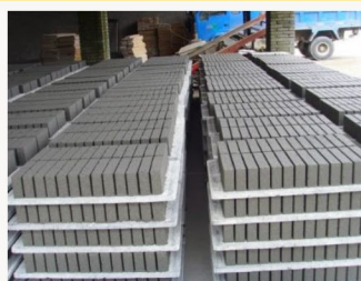
Block, Brick and Pavers

Precast panel 'Vibracrete' walls to provide a stronger, lighter support for pre-cast walls.